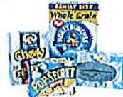
Paperboard No wax coated paperboard