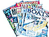
Magazines & Catalogs Any size magazine