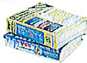
Phone Books All types and sizes