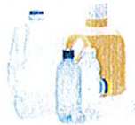
*Plastic Jugs/Bottles (#1 & #2)