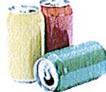
*Aluminum Cans Empty cans only