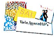
Junk Mail Envelopes, flyers, brochures, postcards etc.