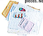
Office Paper All types and sizes