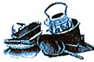
Pots & Pans Kitchen cookware