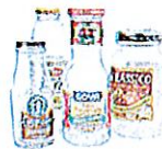
*Clear and Colored Glass Empty containers only