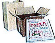
Cardboard & Paper Bags Flatten cardboard & cut into pieces. No wax coated cardboard